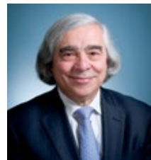
Ernest J. Moniz