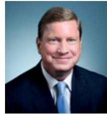
Thomas A. Fanning